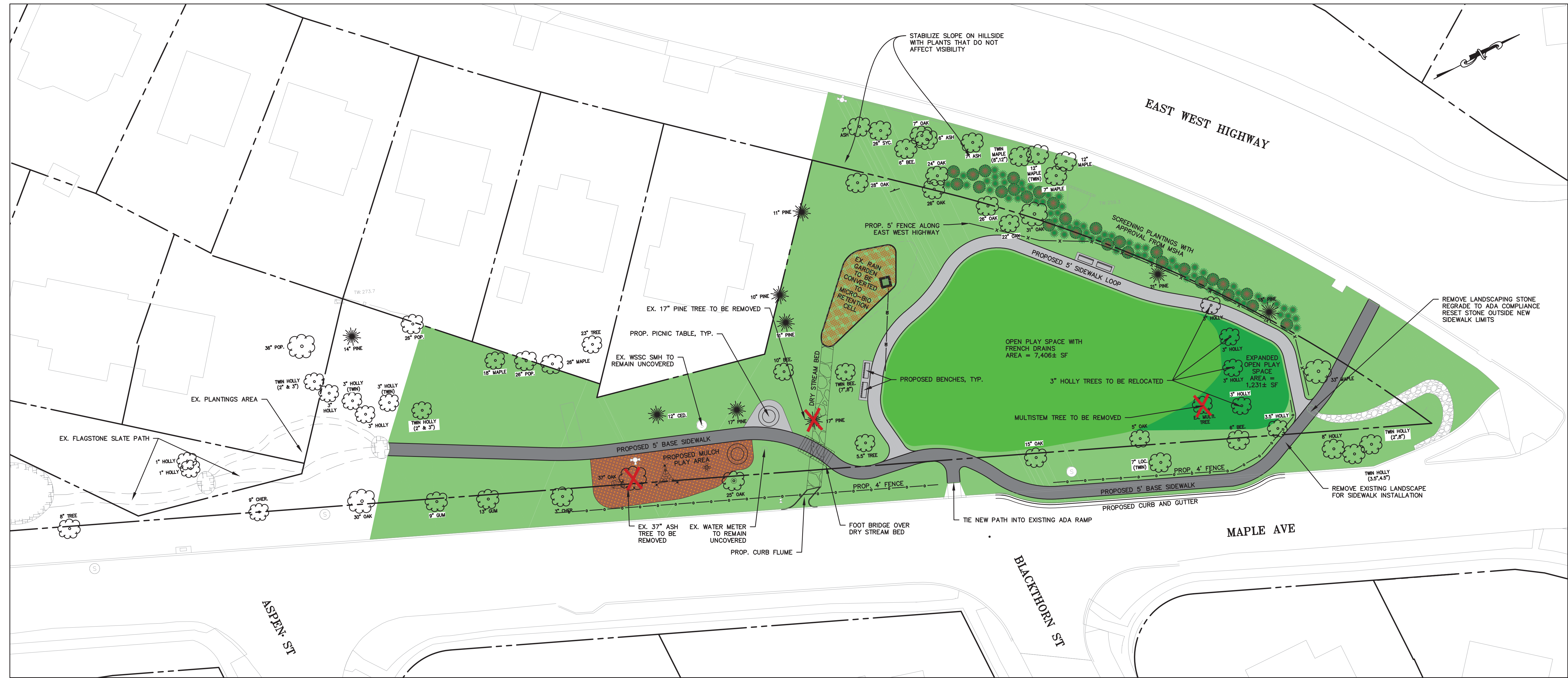
SITE PLAN 1" = 20'