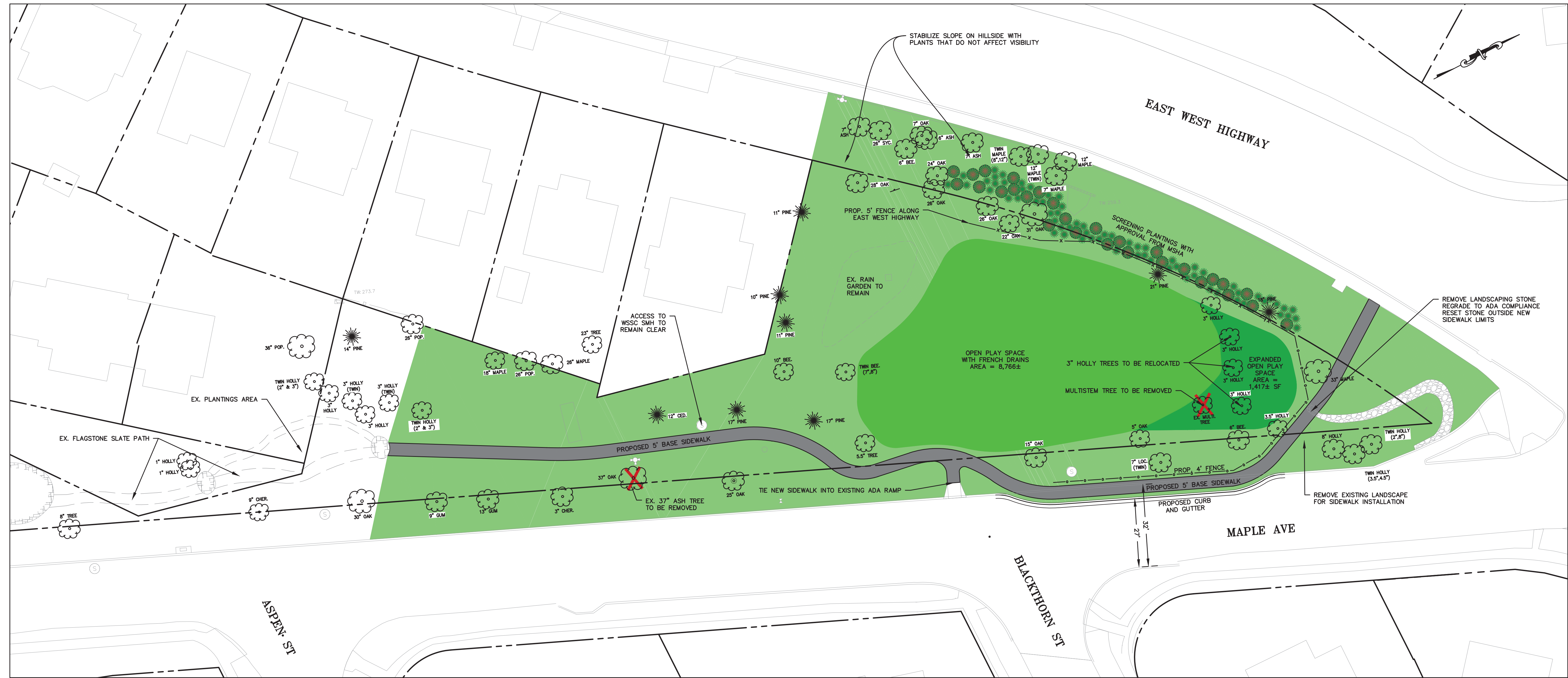
SITE PLAN 1" = 20'

J:\785.001 - Zimmerman Park\CAO\CONCEPTS\CONCEPT 6 - COLOR.dwg 1/20/2022 1:38 PM