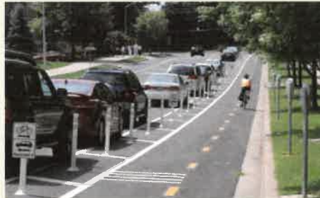
A two-way cycletrack on Woodglenn Dr

Work will take place during the day and at night. Every effort will be made to minimize disruption to traffic, parking, pedestrians, residents, and businesses. We appreciate your patience.